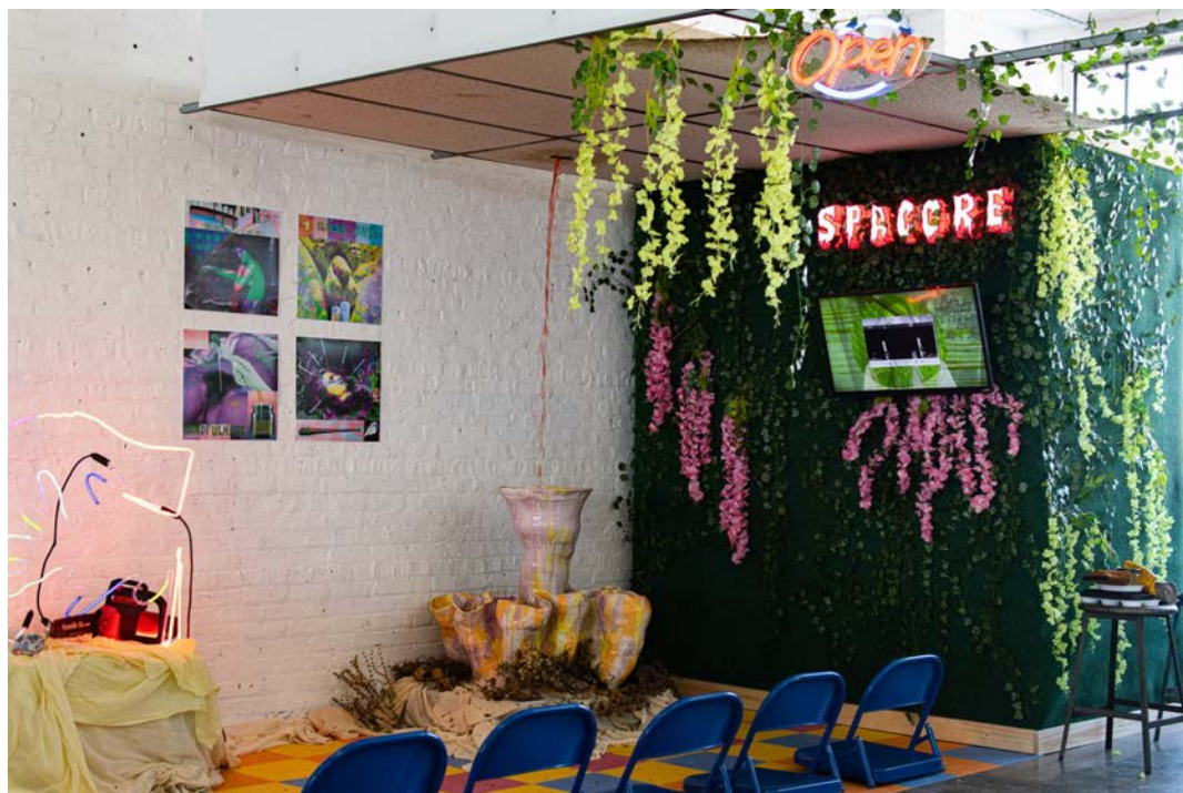
SPACORE at MDW Fair, 2022