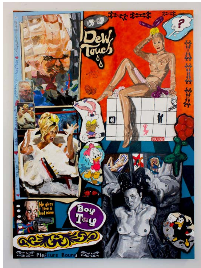
Tali Halpern, Pleasure Bound , 2023